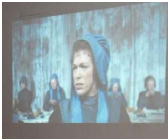
A hilarious scene from the movie.