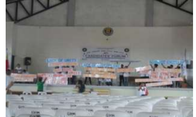
Final practice for the pantomime skit entitled "Sino nga ba?"