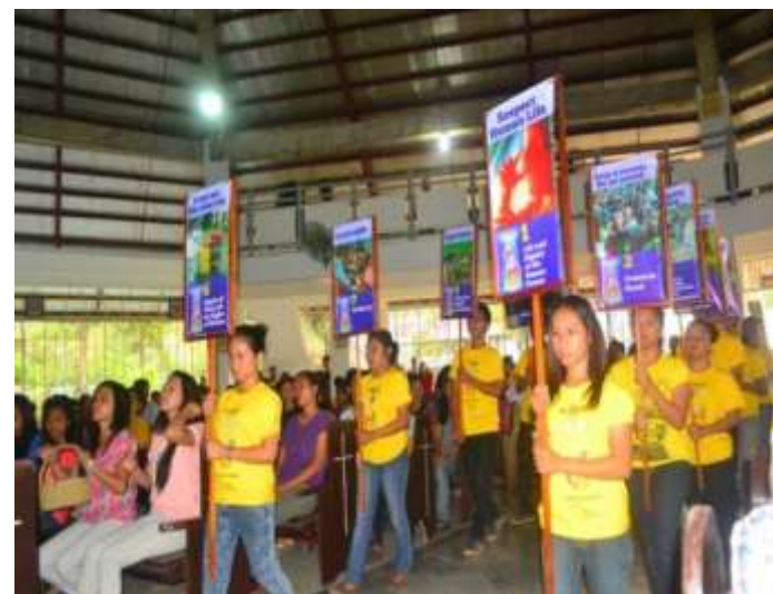
CMO members offered the 10 Catholic Social Teaching.