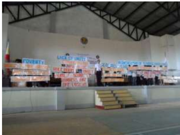
CMO members presented a pantomime skit entitled "Sino Nga Nga Ba?"