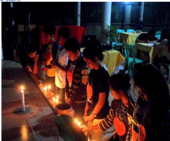
CMO members lit their candles and pray for petitions.