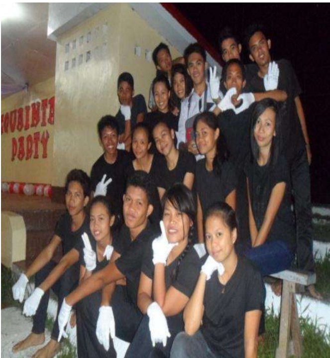
CMO members preparing for their Handmime presentation.