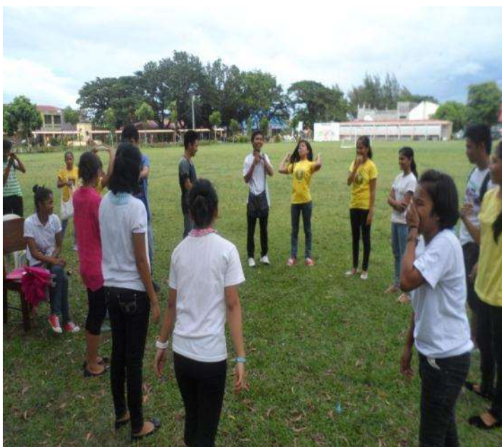
Fellowship games in the field.