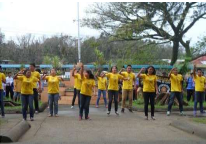
CMO member presented an animation with the song "Look my way".