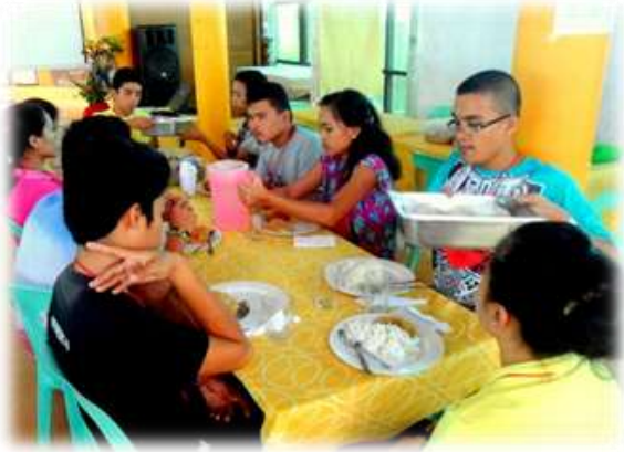
During Lunch the participants had Monks meal where they learned being sensitive on the needs of each other.