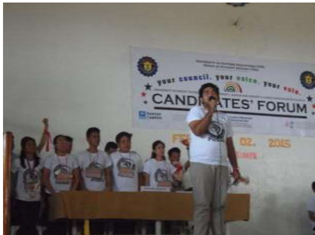
PULSO Party standard bearer presented their candidates.