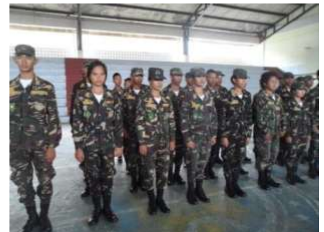
ROTC cadets attended the forum.