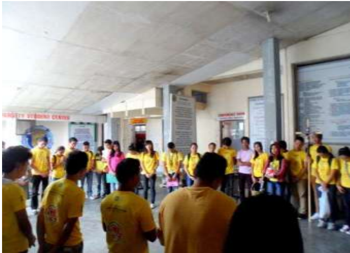
CMO members prayed before the parade started.