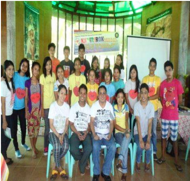
CMO General Assembly- Newly Elected Officers.