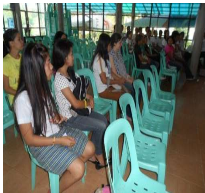
CMO members listening intently to the Homily.