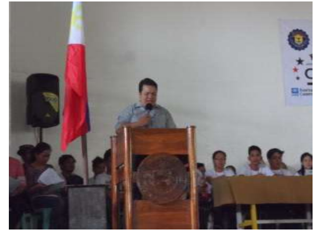
SAMAR Party standard bearer presented their candidates.