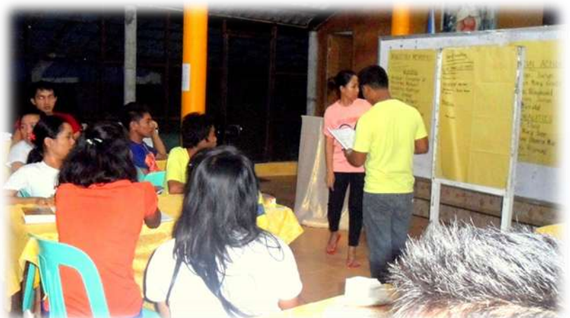
Meeting for upcoming events – Toy Drive, Reconciliation and Christmas Party. After the meeting, Election for appointed officers.