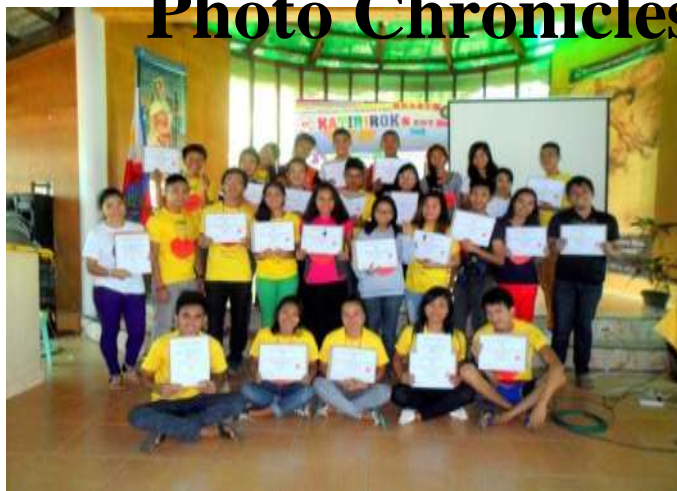
The H.E.A.R.T.S graduates.