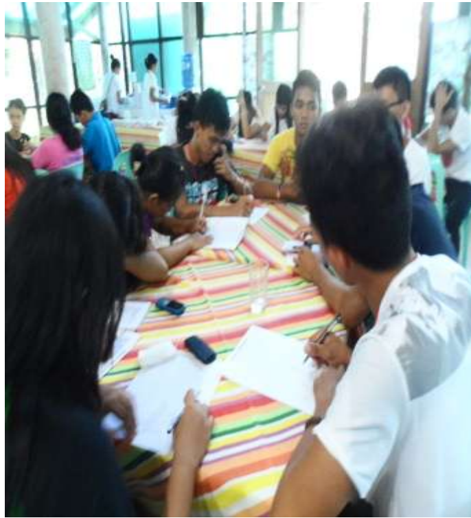
Participant while doing the relationship deepening activity.