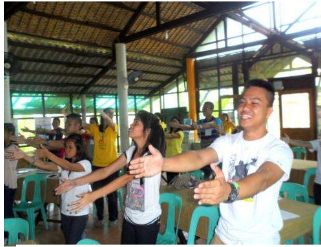
Animation joyfully danced by the participants.