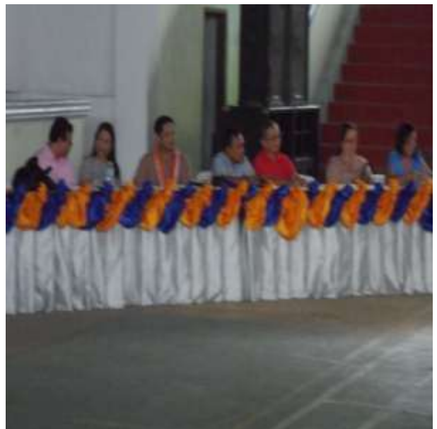
Faculty members who attended the event.