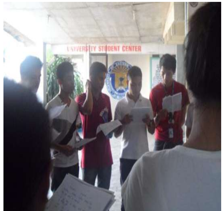
Choir members doing their best during the workshop. Honesty group collected their heart-shaped papers wherein their