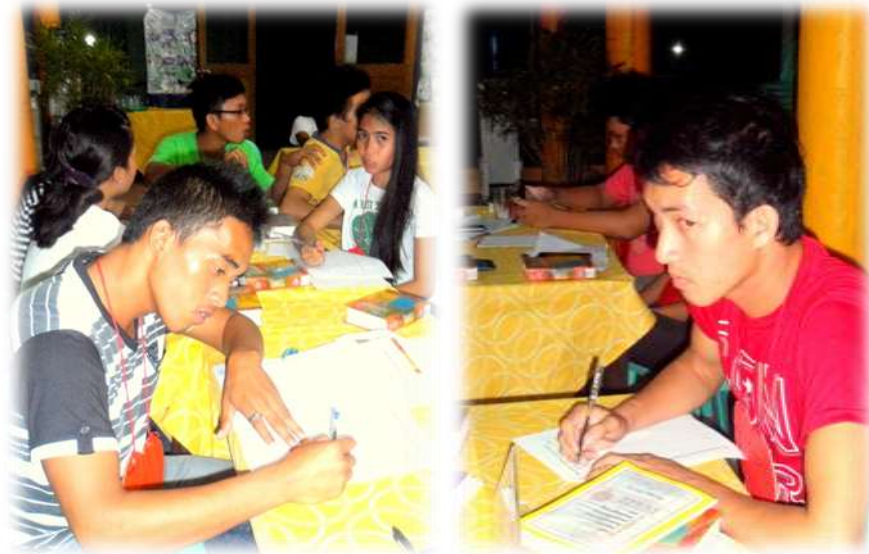
The participants sign up for their Faith Sharing Schedule.