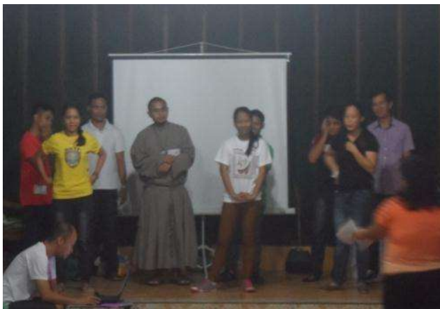
Group Honesty presented their cheer.