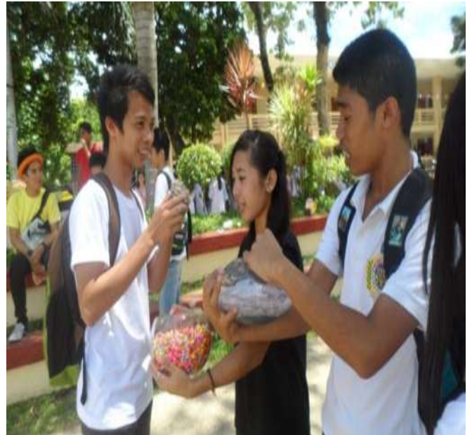
Distribution of Messages from the Heart and selling of key chains.