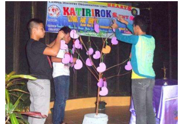
CMO members hung their paper hearts while praying for their intentions.