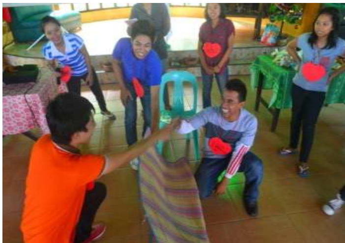
Guess Who Game