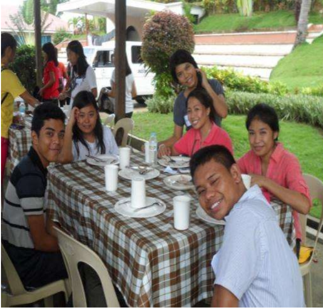
The participants had their community lunch.