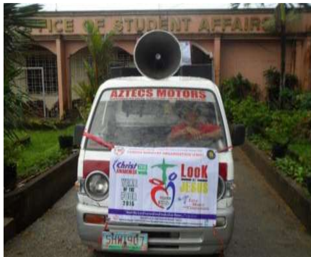
Multi-cab borrowed from Machinery Department used during the parade to carry the sound system.