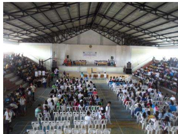
Candidates and students during the forum.