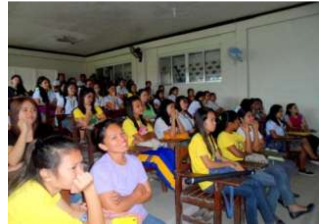
UEP students enjoyed watching of the movie.