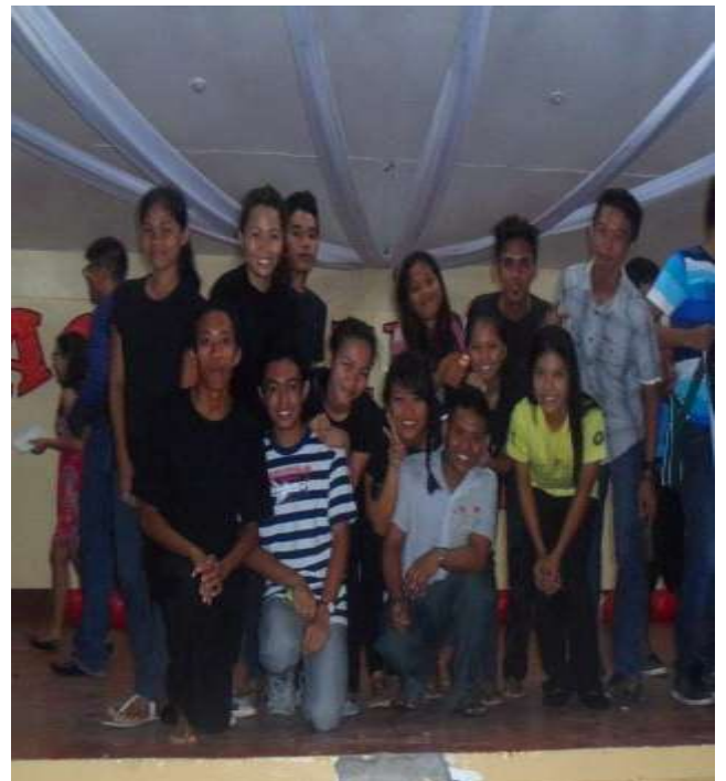
Group picture after the event.