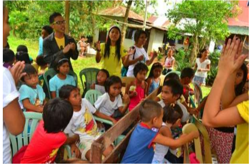
The volunteers sung Christmas carols with the kids.