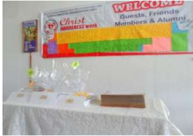
Tarpaulin, prizes and certificates were neatly placed in front.