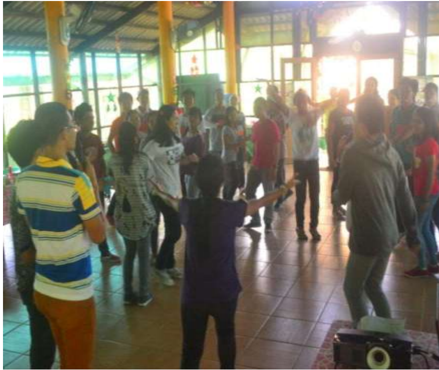
The boat is sinking game.