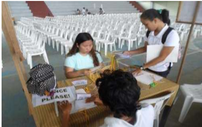
CMO member while preparing the ID jackets.