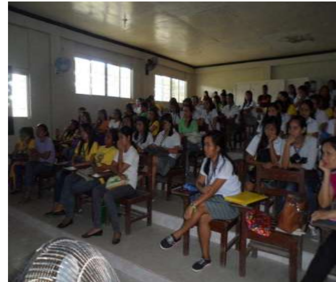
UEP students were carried in the middle part of the movie.