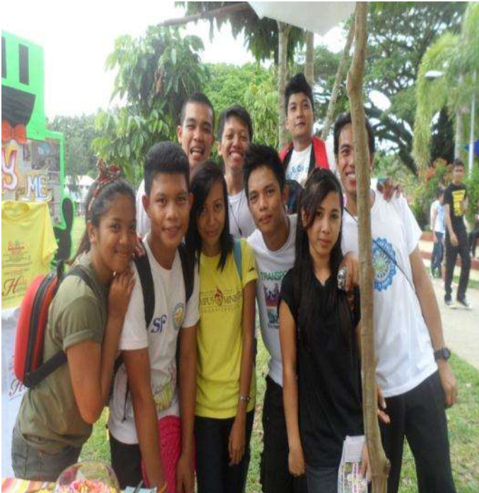
CMO Members actively participated the event.