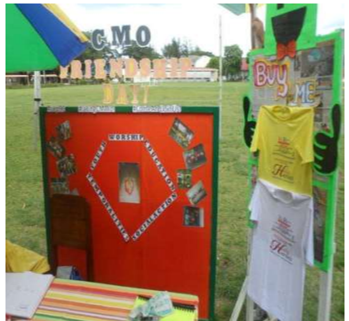
CMO Friendship Day Booth.