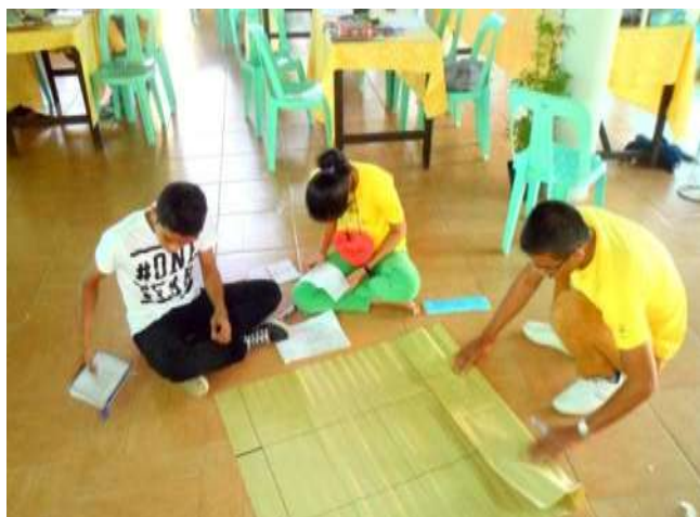
Over-all coordinators' planning.