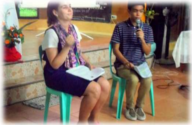
Role playing on How to Conduct yourself in s Job interview, Showing What to do and what not to do during Job Interview