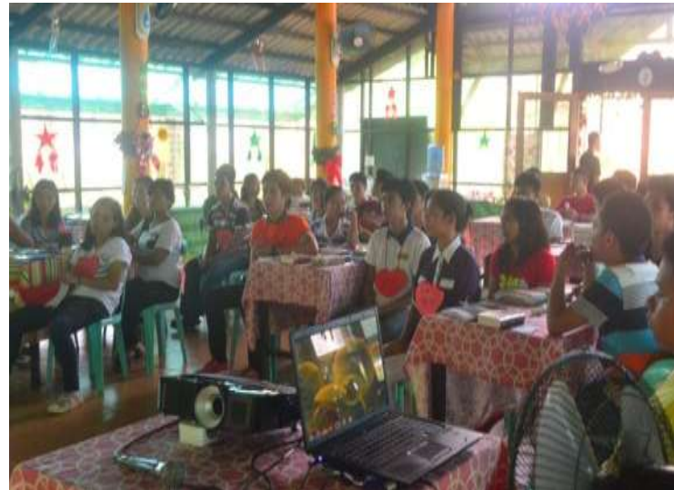
CMO members listening intently.