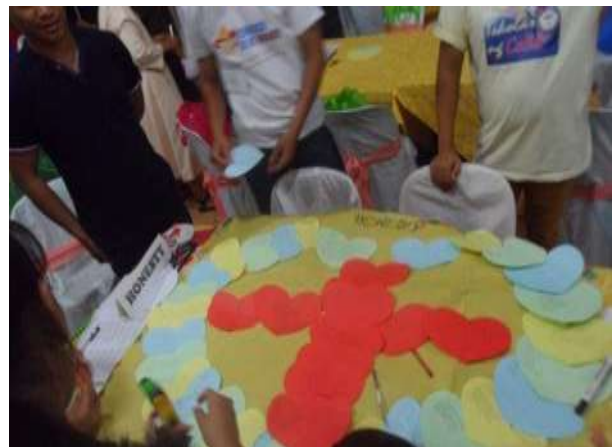
virtue of Heroism and holiness was written.