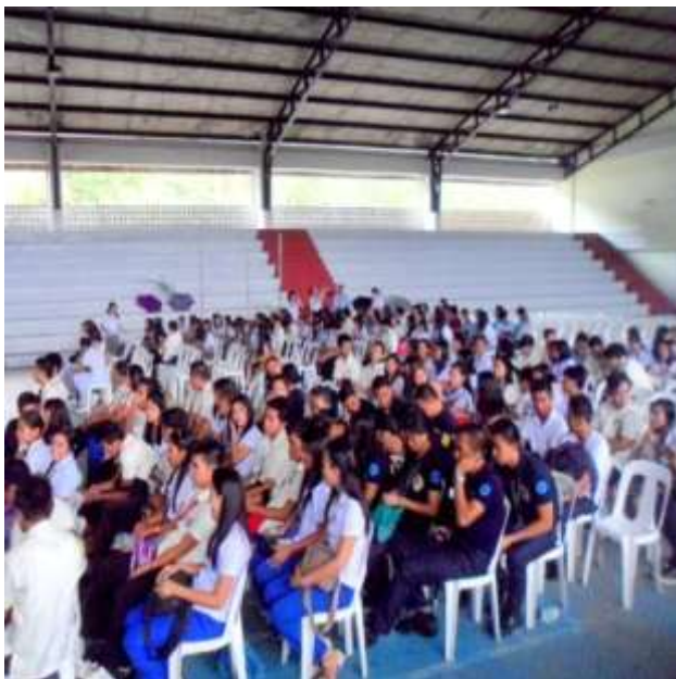
Students who attended the event.