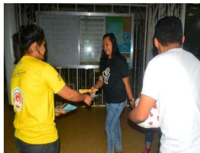
CMO members distributed flyers and messages from the heart after the Mass.