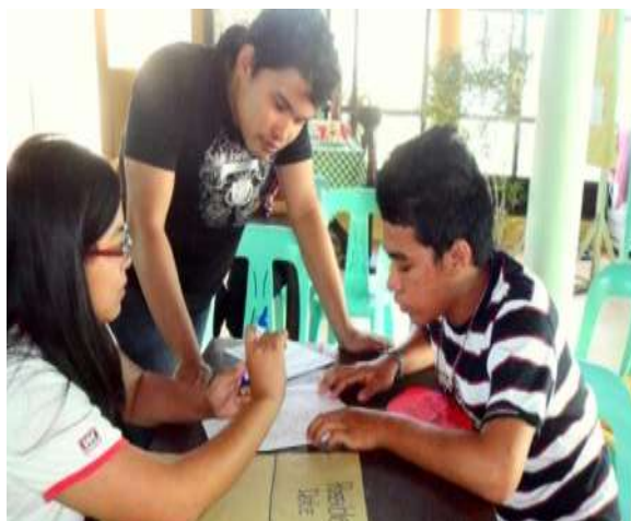
Social Action Ministry planning.