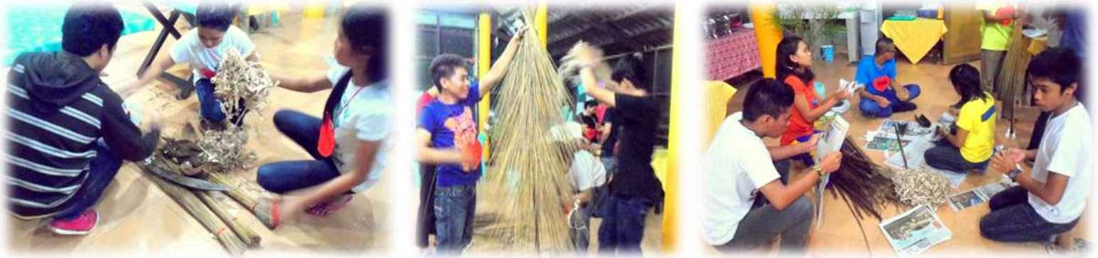
Christmas Tree Making using Biodegradable Materials with the theme White Christmas.