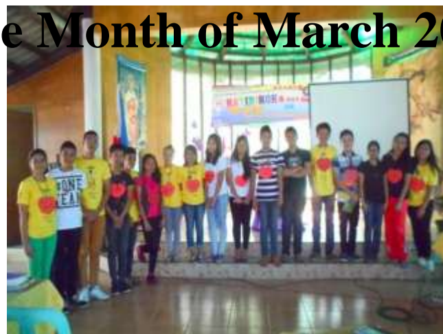
The new sets of elected officers.