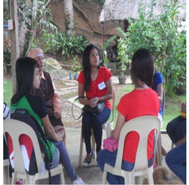
Life sharing and introduction to the consecrated life for the youth to be more aware of the life that has commitment and of service to the Lord.