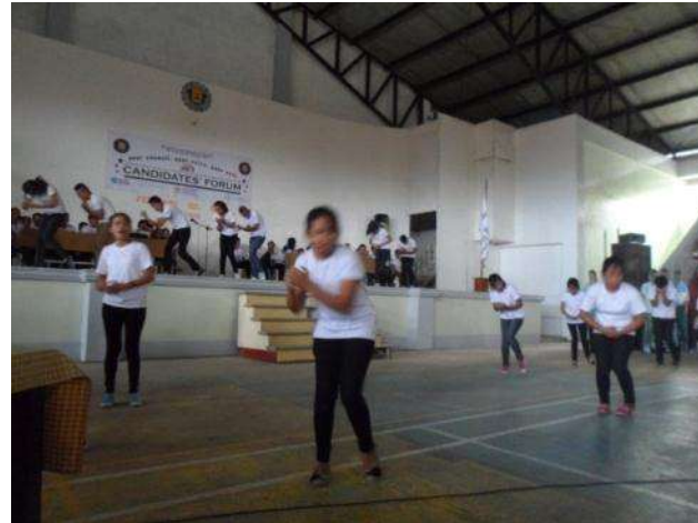
CMO members presented an animation with the song "Kabataan".