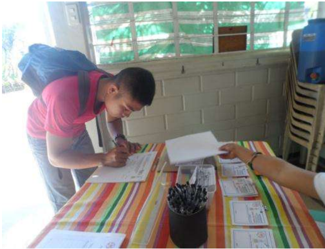
Registration and giving of reflection questions during the Look at Jesus Part 1 Formation Seminar.