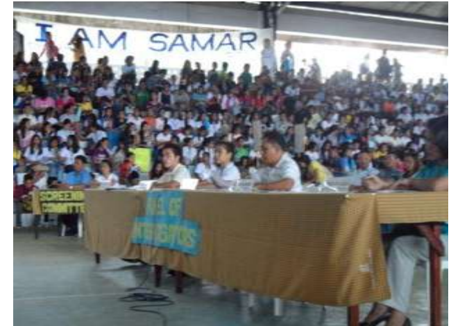
Panel of Interrogators.