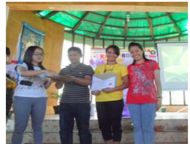
Awarding of Certificates of Completion to members who completed the H.E.A.R.T.S Formation.