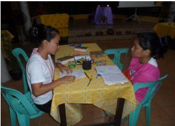
One-on-One sharing and prayer while waiting for the event to start.