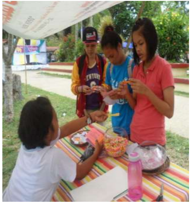
Students who passed by were also given Leadership Quotations.