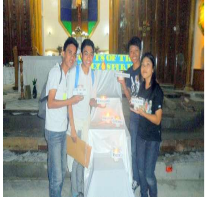
CMO helped in facilitating the Mass of the Holy Spirit in UEP Chapel.