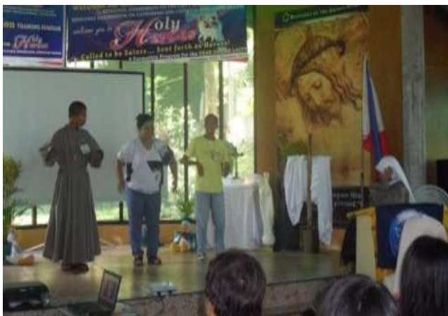
Ate Rica and two participants led an animation.