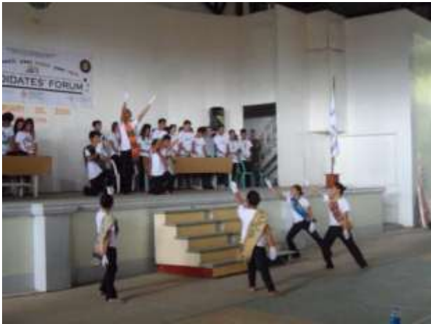
CMO members presented a doxology with the song "Awit ng Paghahangad."