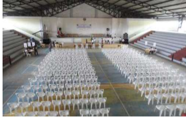
Set-up for the forum.