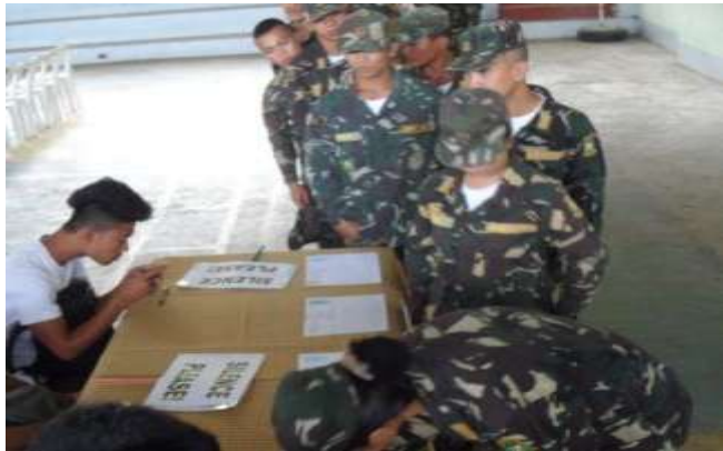
Reserved Officer Training Corps (ROTC) registered their names