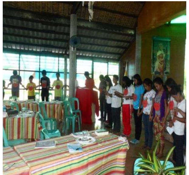
Closing and binding prayer.