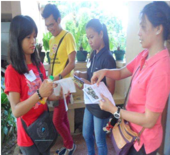
Giving out brochures to the participants.