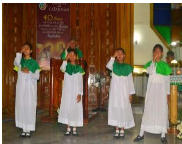
UEP Chaplaincy Altar servers presented an animation with the song "Kapatan katuig nga paglakaton".