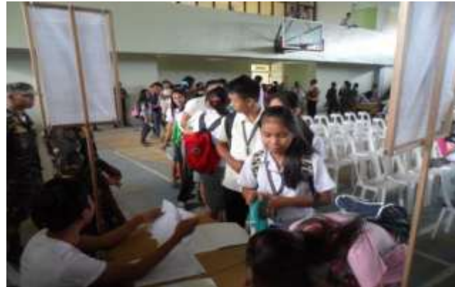
Students during the registration.