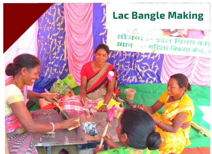
Lac Bangle Making