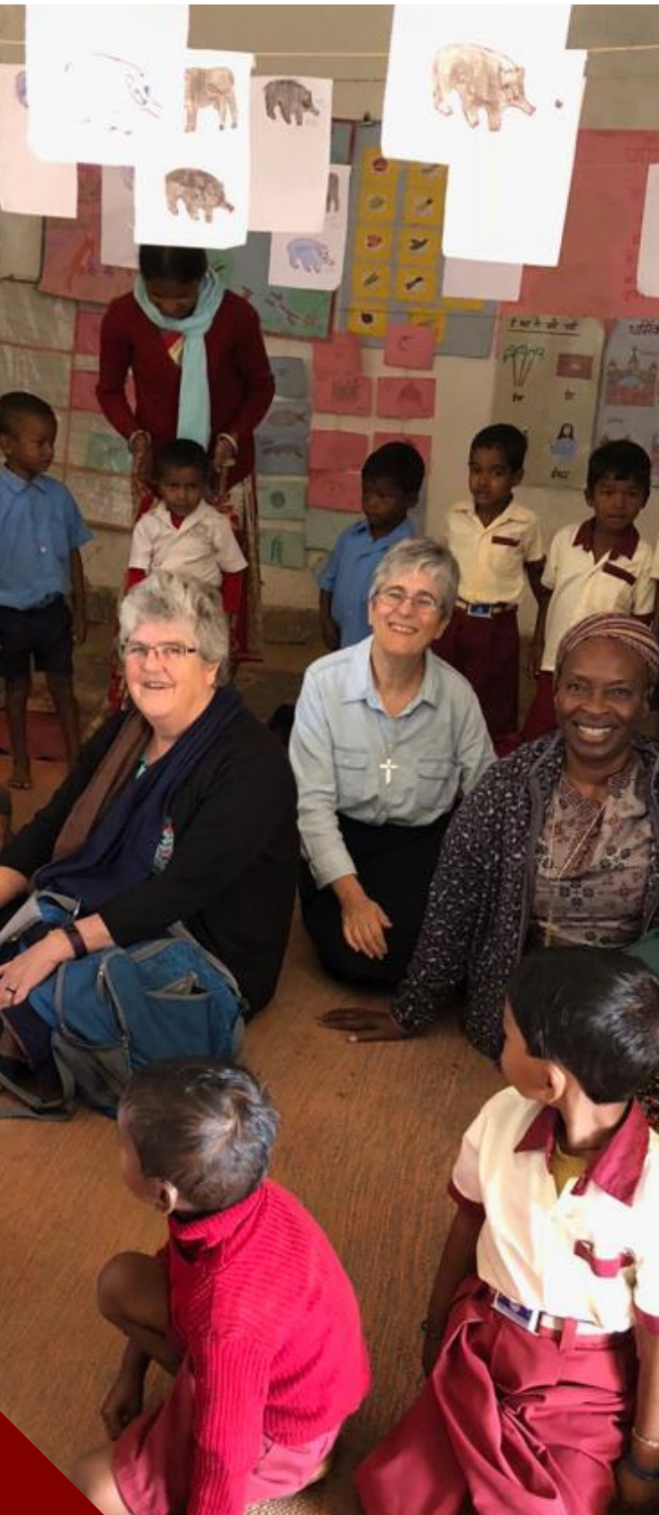
Mother General and Councillors visit Govt School-Torpa