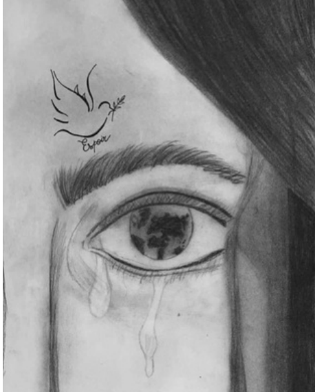
MYRIAM LATIF DAWOOD

Istituto Sacro Cuore Trinità dei Monti, Italy