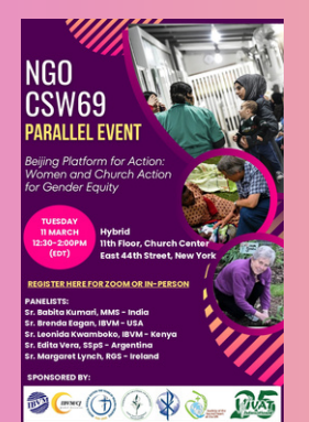
WEBINAR CO-ORGANISED BY THE SACRED HEART