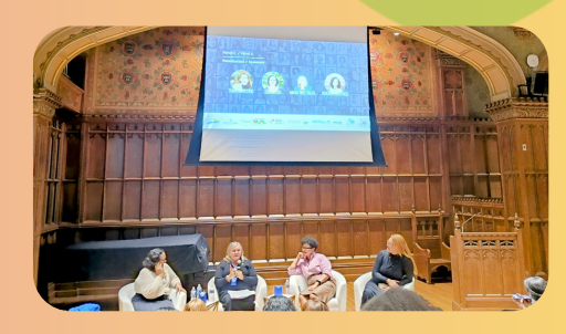
Side Event by Brazil at Columbia University: gender equality in care and climate change

Many side events highlighted the relation between gender and climate change, and the need to involve more men in the fight for gender equality.