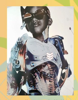
mage created by AI presented at CSW69. AI car reinforce gender inequalities

I witnessed women's perseverance and responsibility in NGOs and state bodies to achieve the goals set thirty years earlier in Beijing. Our meeting in the UN was an expression of our solidarity.