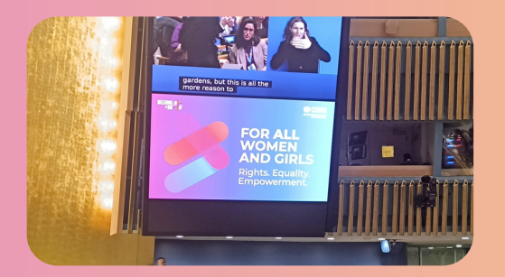
A young girl reciting a poem in front of the Secretary General

Many events included youth voices, speaking up about the importance of their role in advancing gender equality. As a young person, I felt represented at CSW69, thus more valued.