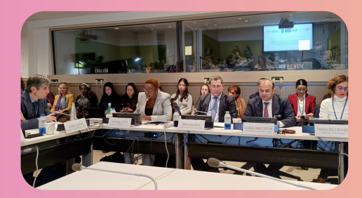
Side Event by Armenia, next host of cop17 in 2026

was pleased that many countries, including less prominent ones, organized and participated in side events, demonstrating their commitment to engaging in discussions with the UN and civil society.