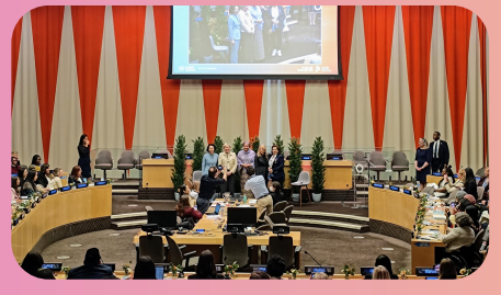
ECOSOC CHAMBER: EVENT WITH PRESIDENT OF ICELAND, DISCUSSING ACHIVEMENTS IN WOMEN'S LEADERSHIP